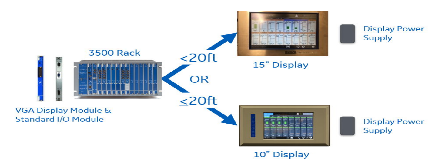
Figure 2: Single Rack with One Display