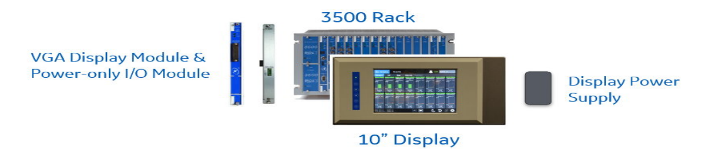
Figure 1: Single Rack with One Face Mount Display

In addition to these options, all purchasing options automatically include a 3500/94M VGA display module and appropriate I/O module. Separate components are available individually. See "Ordering Information" on page 8.