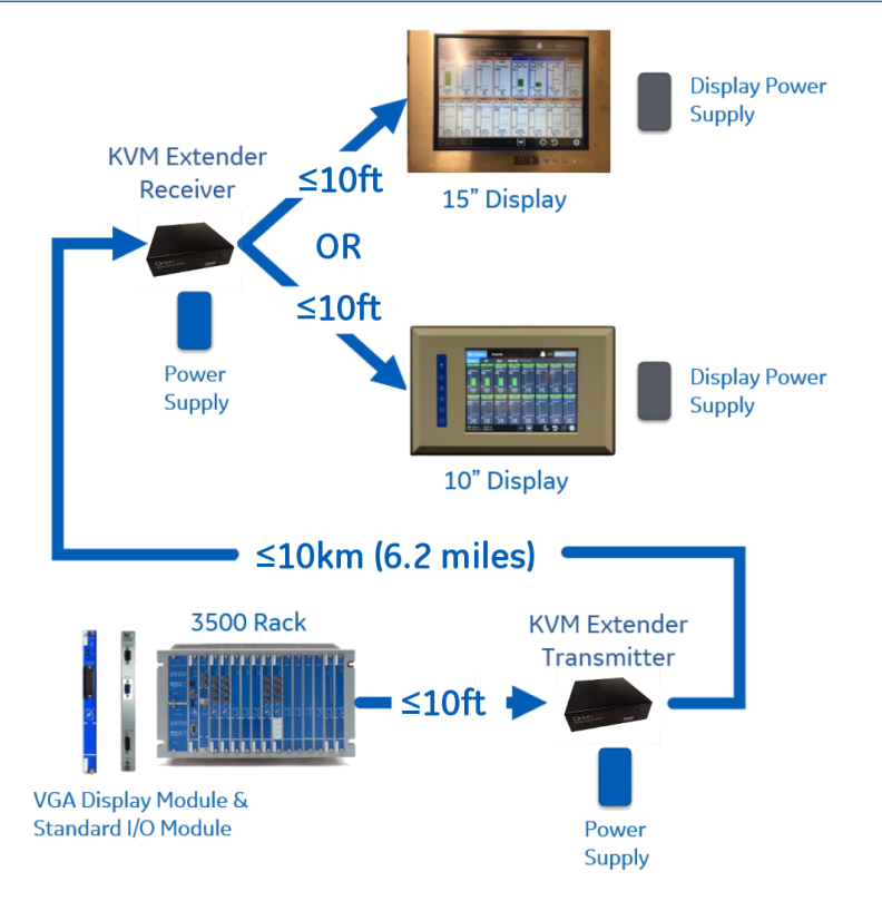
Figure 5: Single-mode Fiber Optic (SM FO) Keyboard Video Monitor (KVM) Extender to One Display